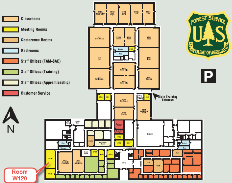
Wildland Fire Training and Conference Center